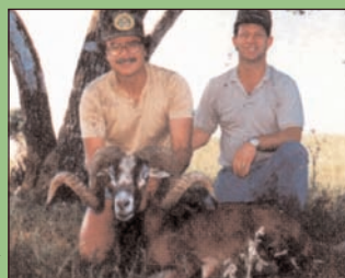
CORSICAN SHEEP 40 4/8" x 40 2/8"