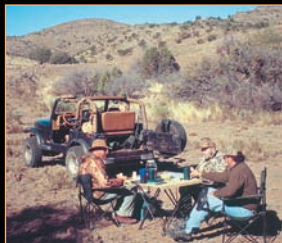
Lunch break while free-range sheep hunting.

But there is another free-range North American sheep slam available to hunters consisting of Red Sheep, Armenian Mouflon, European Mouflon, and Aoudad.