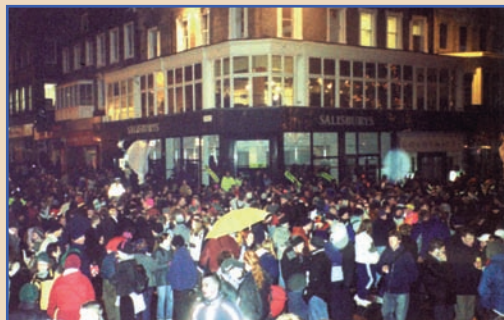
Hogmanay in Edinburgh

The cities and countryside of Scotland are replete with history and beauty that you will experience interspersed among the fantastic hunting that is available.